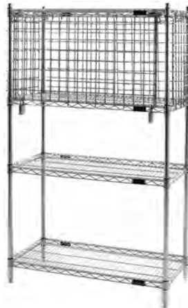
security module with flip-up door

(security modules shown assembled to wire shelf units)