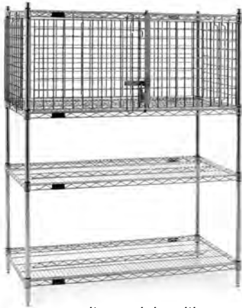
security module with hinged doors

Eagle Security Modules, model _____ (EAGLEbrite® zinc, Chrome, Valu-Gard® epoxy, EAGLEgard® epoxy, Stainless Steel) finish. Includes door(s), end panels, and rear panel. Available with hinged doors or single flip-up door. Fits in between two wire shelves that are spaced 20" apart.