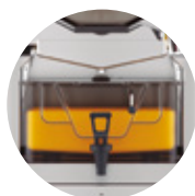
Speed S +plus Tank All-in-One