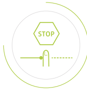
ON-OFF SAFETY SENSORS

It also has overload protection and an emergency stop button that deactivates all the systems if needed.