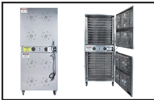
Digital Control Panel

*35" depth with backstop installed 30" depth without backstop