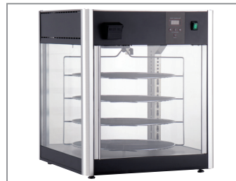
EDM-1K with 4-Tier Round Rack