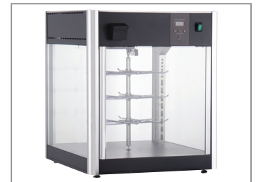
EDM-1K with Pretzel Rack