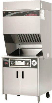
Model WVG136 SHOWN