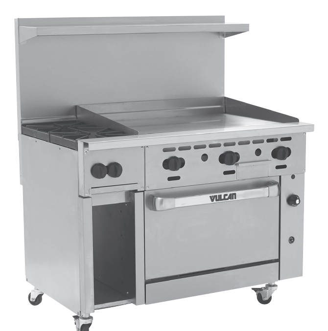
Model 48S-2B36GN (shown with optional casters)

2 OPEN BURNERS / 36" GRIDDLE 48" WIDE GAS RANGE