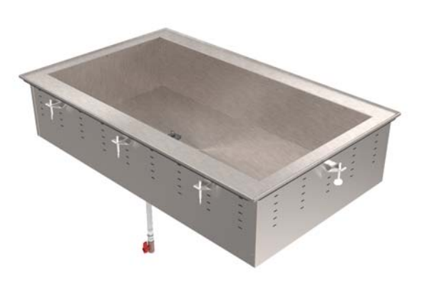
Short Side Non-Refrigerated Cold Pan Drop-in