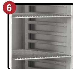
GN Fixed Rack