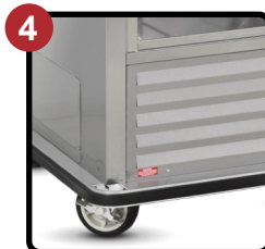
Bottom Mounted Compressor