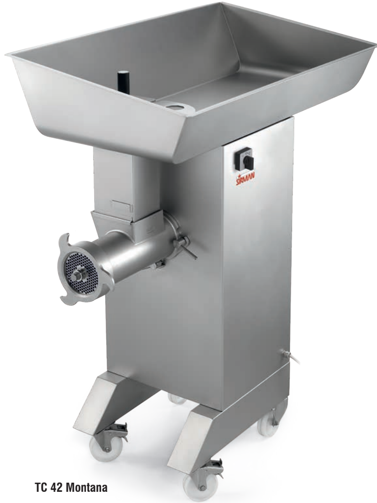
TC 42 Montana

Certified to UL Standard 763 and NSF Standard 08 Certified to CSA Standard C22.2