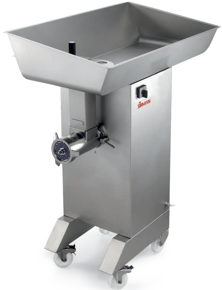
TC 32 Montana