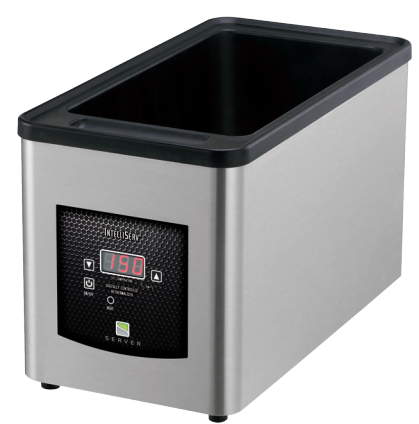
® IS-¹/₃ 86090 INTELLISERV™, ¹/₃