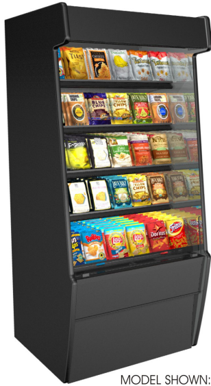
MODEL SHOWN: CO37