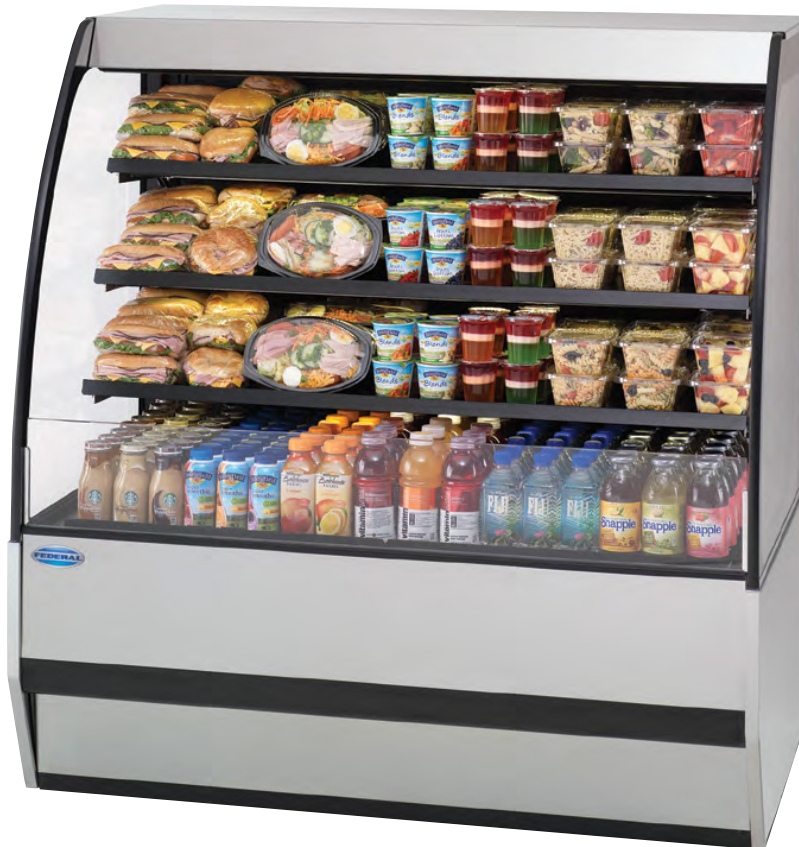
Model SSRPF5952 Shown

Designed for those customers looking for up-market styling for maximum visual appeal that will drive product sales.