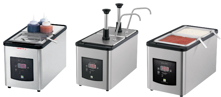
Various IntelliServ™ Combinations