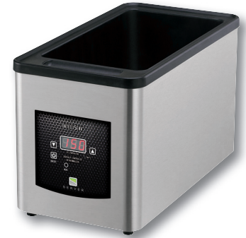
INTELLISERV™ WARMER Model IS-1/3