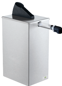
SE-SS DP 100236