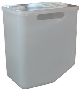
Lid 100281 Jar 100280

Countertop and drop-in models are available to suit operational needs