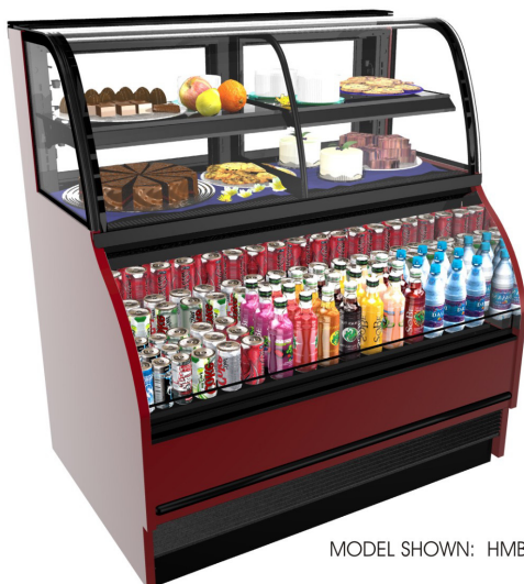
MODEL SHOWN: HMBC4

NOTE: NON-DIVIDED UPPER DISPLAY AREA - HMBC2 & HMBC3 DIVIDED UPPER DISPLAY AREA - HMBC4, HMBC5 & HMBC6