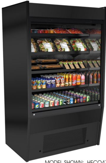
MODEL SHOWN: HECO47R