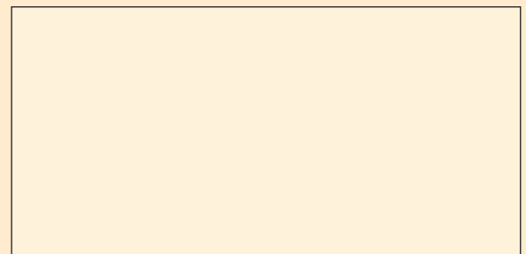
Plate Mate always there when you need it!

The table model is provided with adjustable feet to compensate for any unevenness in the surface. This model is easy to clean with a high-pressure washer or with soap suds and a brush.