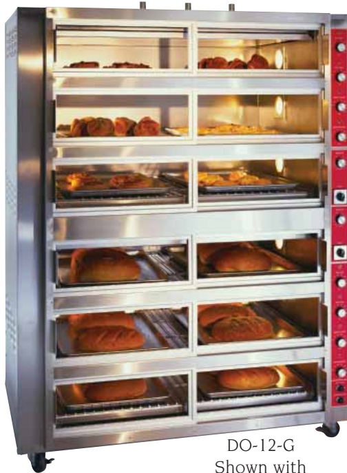
DO-12-G Shown with Glide-By Doors

When high-volume production is a reality and quality baked product is desired, trust the DO-12 from Super Systems. Each individually controlled deck gives our trademark hearth bake, while full-view glass doors provide an effective merchandising tool. Together, these features will help you sell as much product as you can make!