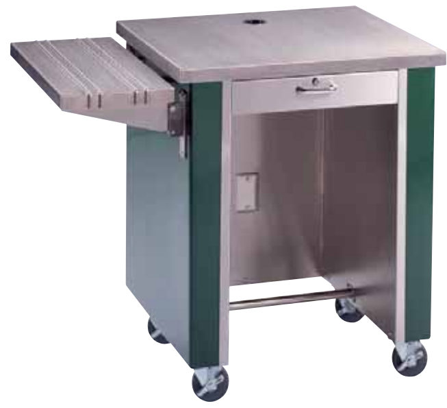
R1-CS shown with optional solid ribbed tray slide

The Reflections Cashier Stand is a comfortable workstation. Ideal for use in cafeteria/buffet lines, school line ups and hospital cafeterias. This Reflections unit is compatible and will interlock with other Reflection units or the Cashier Stand can be operated as a freestanding separate unit.