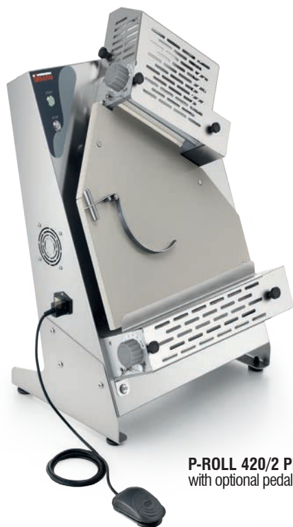
P-ROLL 420/2 PLUS with optional pedal controls