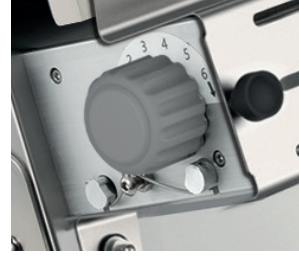
Adjustable thickness by plastic knobs