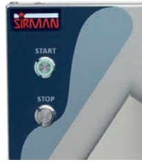
Plus versions with IP 67 stainless steel controls