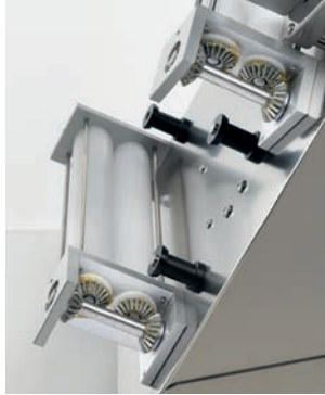
Metal gears transmission

Certified to UL 763 and NSF 08 Certified to CSA Standard C22.2