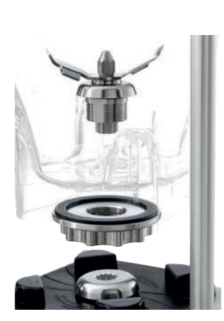
Stainless steel gears