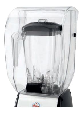
Optional sound-reduction enclosure