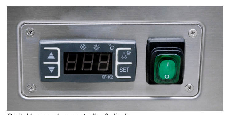
Digital temperature controller & display