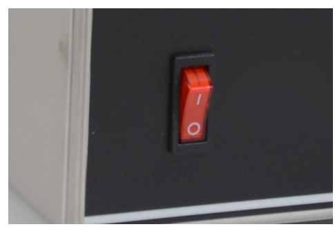
Designed for easy use with just a flick of a switch.