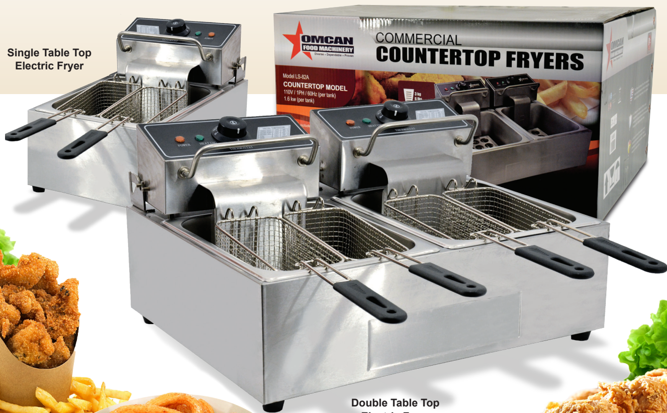
Double Table Top Electric Fryer