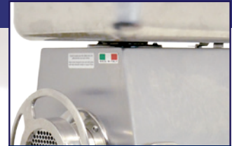
Structured in AISI 304 stainless steel