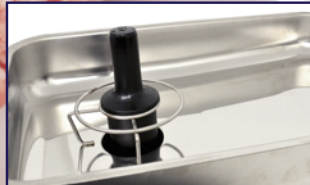
Features a large hopper with hand protection and ABS plastic pusher