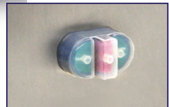
ON/OFF Switch with waterproof rubber protection