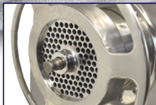
1/4" (6mm) plate included