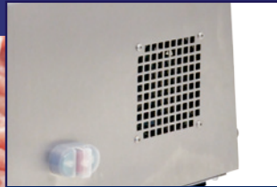
Ventilated motor with thermal protection