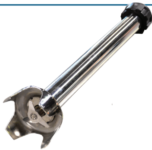
23839 Medium detachable shaft 17 3/4" (450mm)