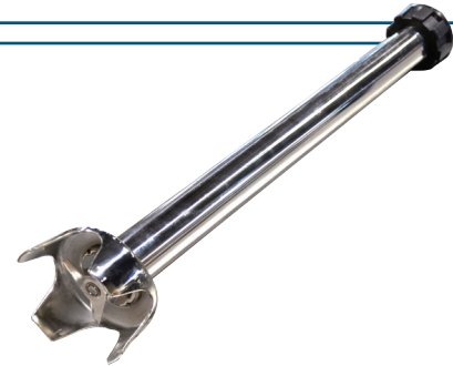
28703 Long detachable shaft 21" (530mm)