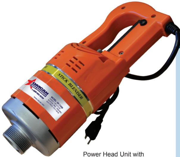
Power Head Unit with Variable Speed Control