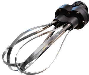
28704 9 1/2" detachable beater