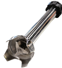
23838 Short detachable shaft 14 3/4" (377mm)