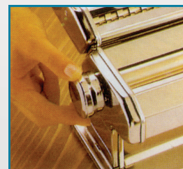
Adjusting the knob