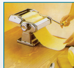
Roller in use