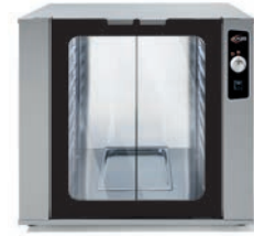
AX-PR8 SHIP WT: 233 lbs