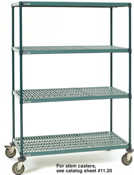
For stem casters, see catalog sheet #11.20