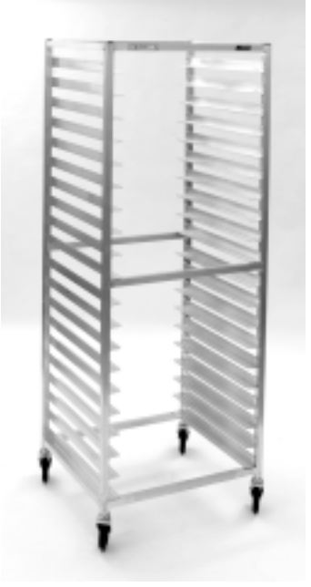
donut rack model# ODR-2320-3