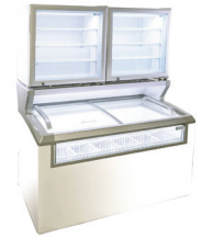
Double Combo-MCT-4HC with 2 optional CTF-3HC