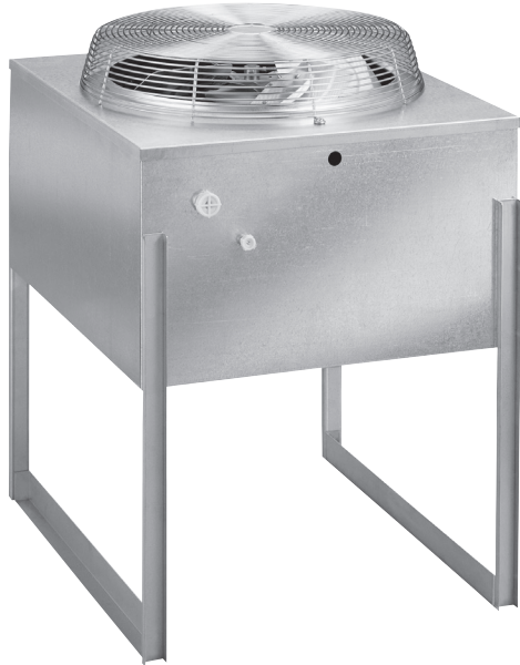
JCF900 Remote Condenser

Models JCF0500 JCF0500Q(Coated Coil) JCF0900 JCF0900Q(Coated Coil)