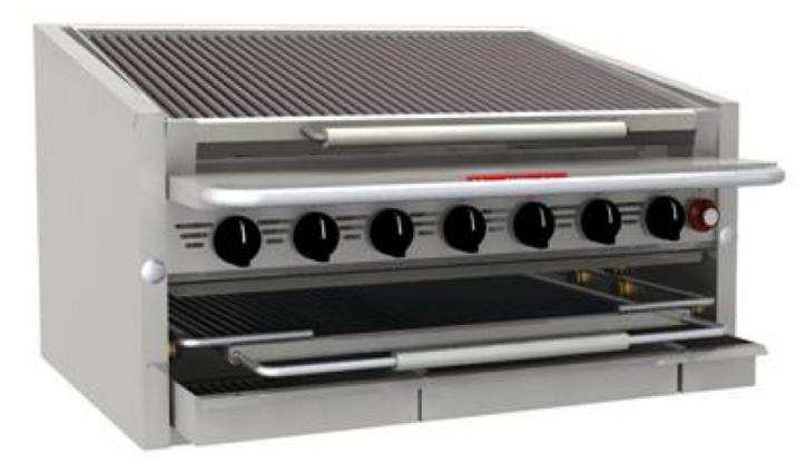
Unit shown with optional lower rack