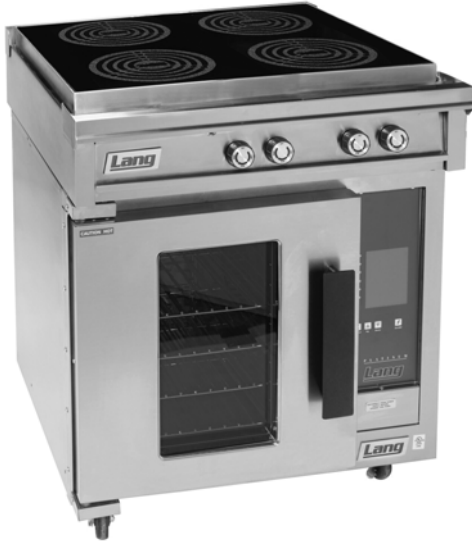
Model RI30C-PTA Shown