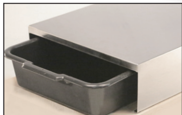
Bus Pan Storage