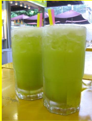
Serve Over Ice