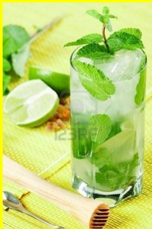
Mix for Mojitos