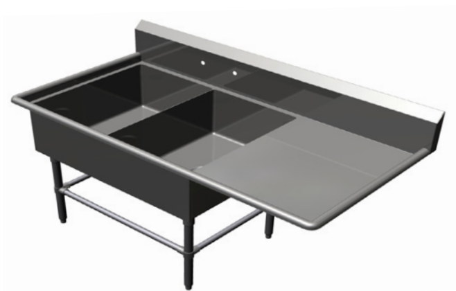
SPECIFY LEFT SIDE OR RIGHT SIDE DRAIN BOARD