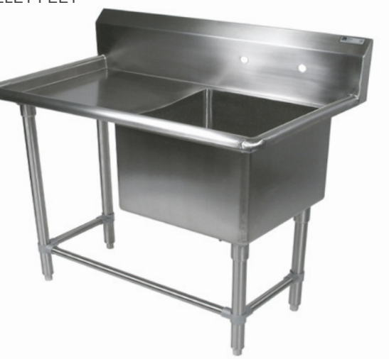
SPECIFY LEFT SIDE OR RIGHT SIDE DRAIN BOARD