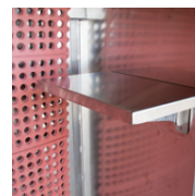
FOLD DOWN CHEMICAL SHELF