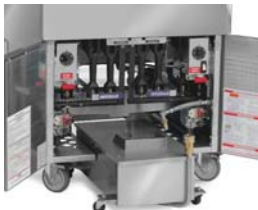
Filter is located under fryers to save valuable space.