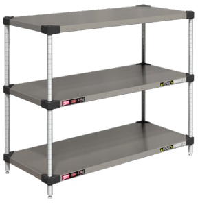
Shown as a tiered shelving unit.