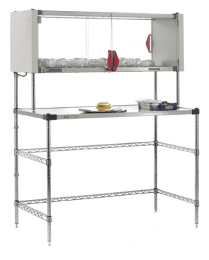
Heated shelf enclosure kit shown with a Super Erecta workstation.