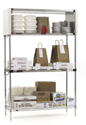
Shown with heated shelf, enclosure kit and standard Super Erecta shelving.