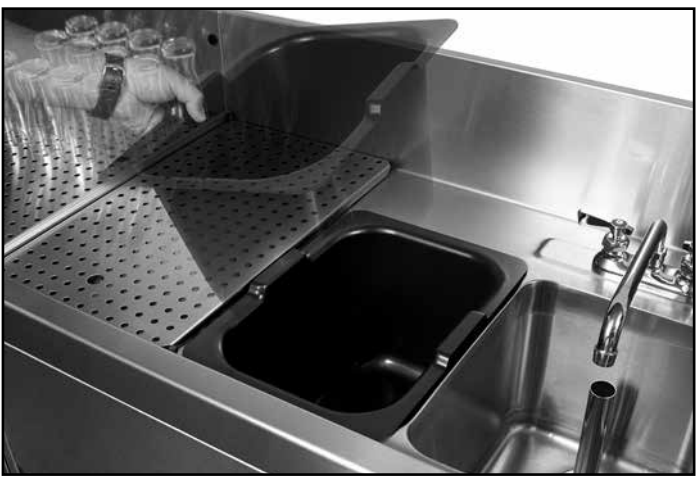
LWS simply drops into a bar sink bowl