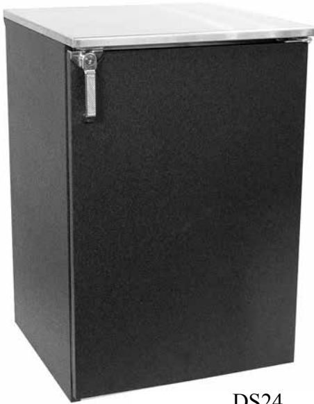
DS24 with black vinyl-clad door and stainless steel top