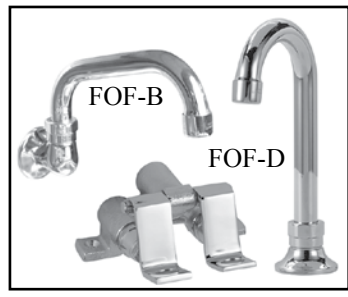
Optional foot-operated faucet

• 20 gauge stainless steel parts include: all components unless otherwise noted