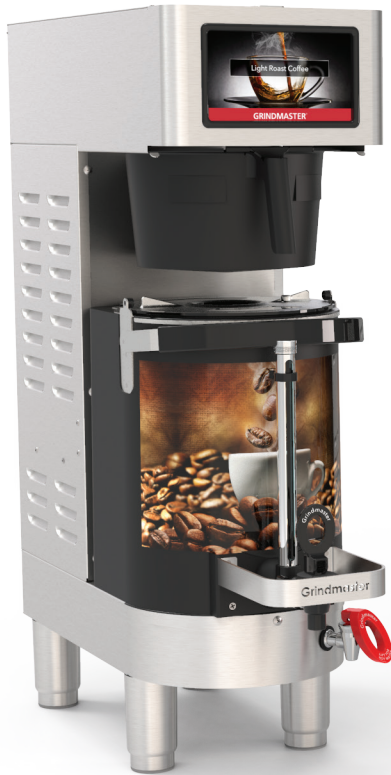
model PBC-1W warmer Shuttles and graphics sold separately