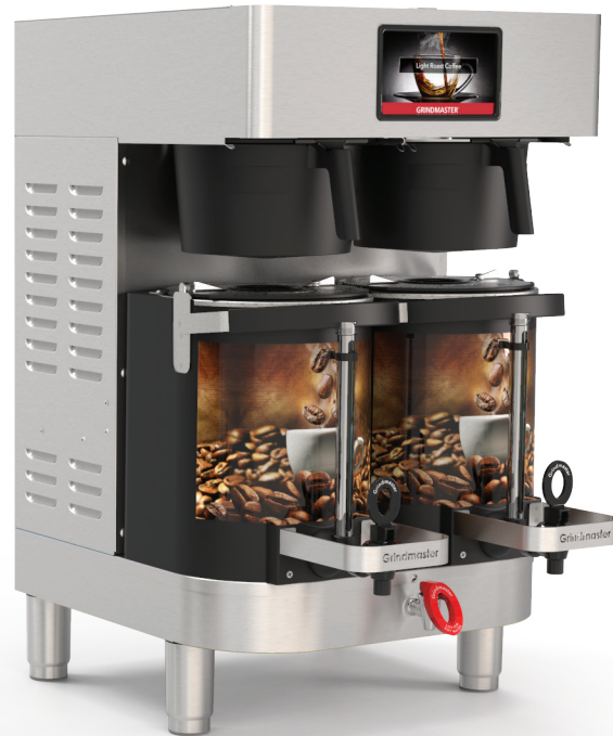
model PBC-2W warmer Shuttles and graphics sold separately