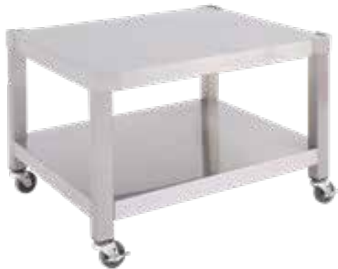
A4528796 Stand for 24" counter models with caster feature