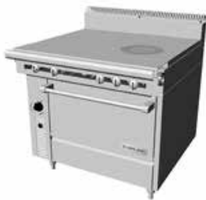
Model C386-11 Range with 18" Front Fired Hot Top & 18" Even Heat Hot Top