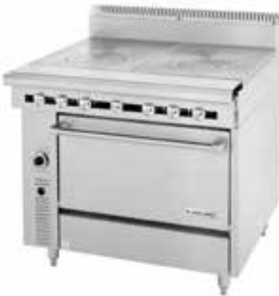
Model C836-10 Range with Two Front-Fired Hot Tops