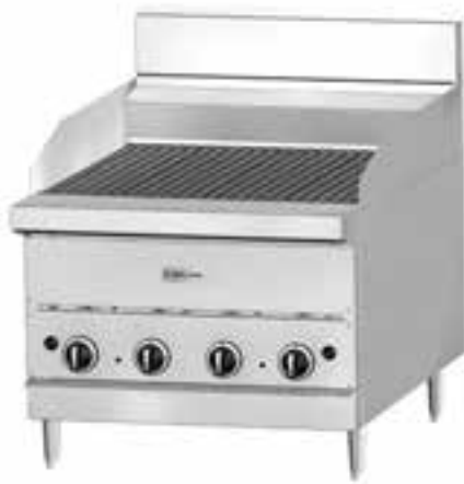
G24-BRL With 4" Legs For Counter Mount